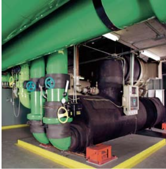
A chiller unit (One America Plaza, San Diego, CA, USA).

through the chiller evaporator (3.). The water temperature is reduced by 5 to 10°C in the evaporator and it is then supplied back to the rooms. The variable water circulation is achieved by the AC drive (2.), and the control parameter is the differential water pressure in the most distant room in order to keep the pressure high enough for the thermostat valves. The differential pressure is measured by the transmitter (4.).