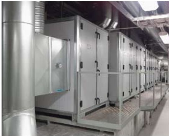
Air handling units (AHUs) of an office building.