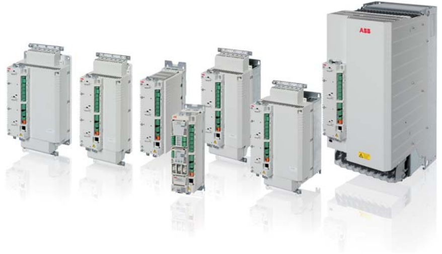
ABB high performance machinery drives provide speed, torque and motion control for demanding applications. They can control induction, synchronous and asynchronous servo and high torque motors with various feedback devices. The compact hardware, different variants and programming flexibility ensure the optimum system solution.