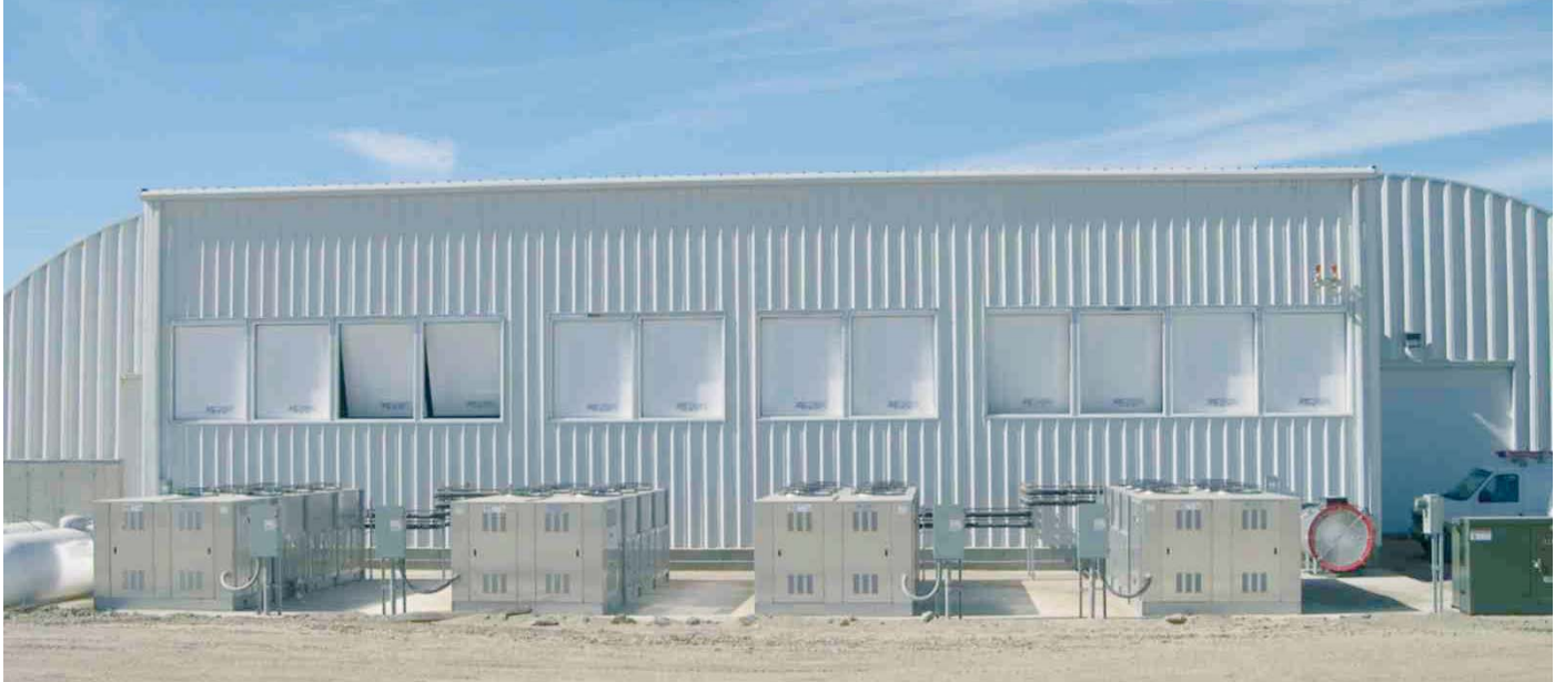
JMC's high-tech storage facilities use ABB drives to keep farm produce fresh.

Based in Washington state, USA, JMC Ventilation Refrigeration specializes in the design and manufacture of custom ventilation and refrigeration systems for potato and onion storage. JMC is using ABB's advanced drive technologies to provide precise, on-site and remote environmental control that helps ensure vegetable quality and reduce mass loss (shrinkage), while saving energy.