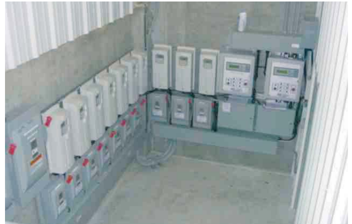
The ABB drives control the storage facilities from an electrical control room.