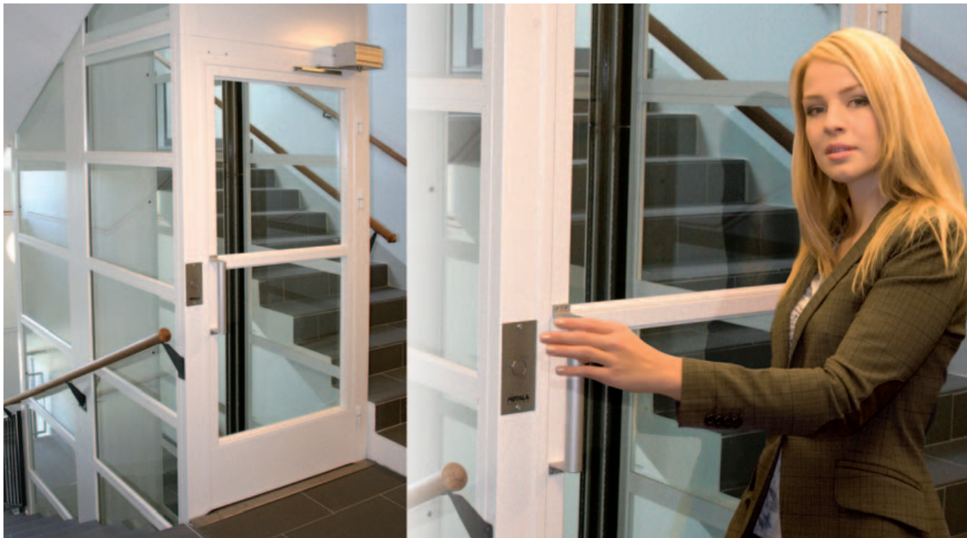
“Largest inside - smallest outside.” The Motala 6000 is designed for stairwells and building exteriors.