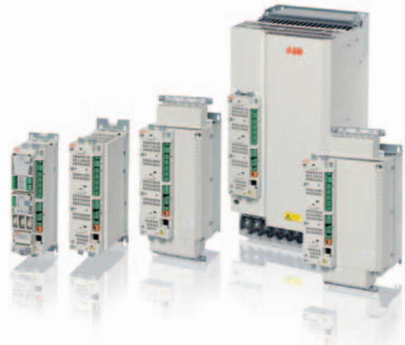
ABB high performance machinery drives.