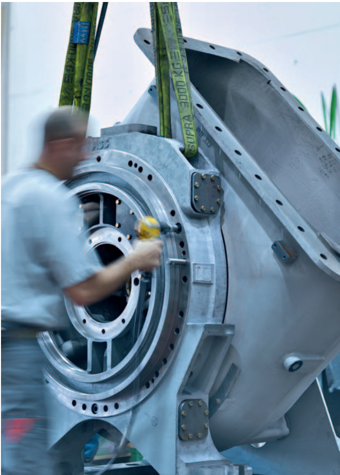
ABB Turbocharging introduces the A100-L turbocharger series as a significant step in the development of single-stage, high-efficiency, high-pressure turbocharging for low-speed, two-stroke engines.

ABB currently supplies the two-stroke engine market with its highly successful TPL..-B family of turbochargers. Since being introduced to the market, more than 5000 TPL..-B units have been specified or put into service worldwide. ABB remains fully committed to supplying the high-performance TPL..-B for present as well as future two-stroke engines requiring compressor pressure ratios of up to 4.2.