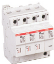
OVR N3-40-440s P TS