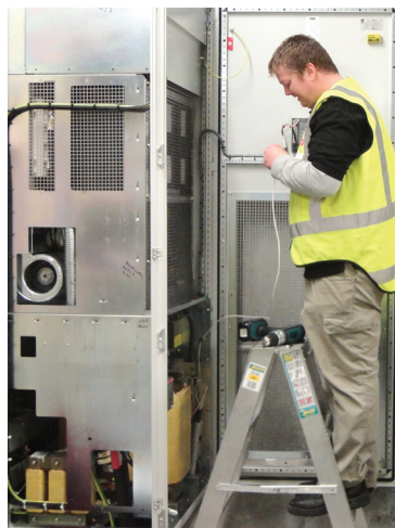
ABB's Low Voltage Products engineer working on the PQF installation.

In addition, there are costs incurred due to extra kWh losses in typical network components such as transformers, cables and motors. These losses are cascaded back to the utility power plants and result in increased CO 2 emissions. The emissions can be significant or marginal depending on the process and the fuel type from which the electrical power is generated.