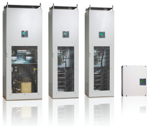
Power Quality filters PQFI, PQFM, PQFK, PQFS.

Under normal conditions, the load of the filter will be distributed evenly over all the filter units operating in parallel. ABB's PQF active filters can be installed in LV networks. They can also be employed in MV networks through the use of a suitable coupling transformer.