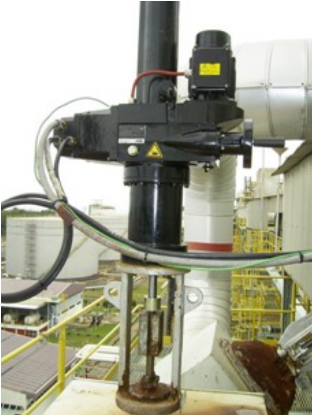
Valves on steam vessels control the amount of cooling water injected into the superheated steam in the superheater and reheater

As is generally known, a body's cooling curve follows an E-function over time and is dependant on the temperature difference between the body and its environment. The smaller the temperature difference, the longer the cooling time needed. The duty cycle restriction of electric motors is primarily intended to keep their self-heating within acceptable limits. High ambient temperatures prolong the cooling time. Rising ambient temperatures decrease the permissible duty cycle. For example, S5-25% duty at 20°C becomes S5-13% duty at 50°C. This means precision control of high dynamic applications in high temperature conditions becomes impossible.