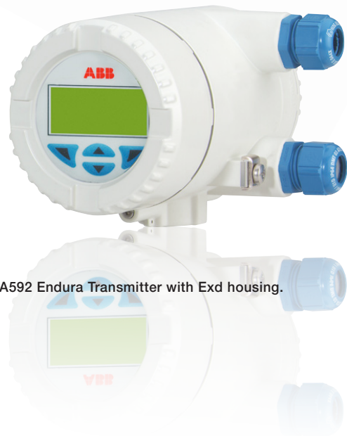
New APA592 Endura Transmitter with Exd housing.