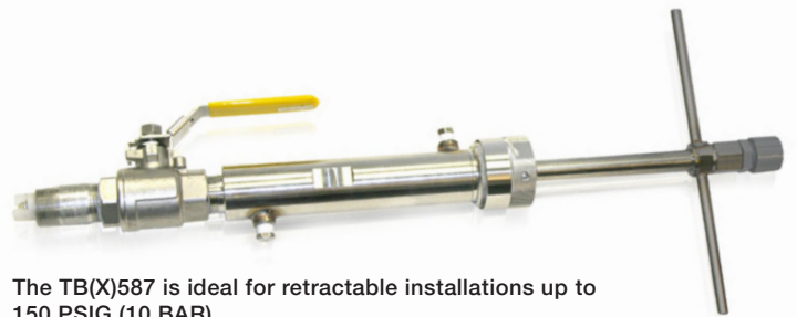
The TB(X)587 is ideal for retractable installations up to 150 PSIG (10 BAR)