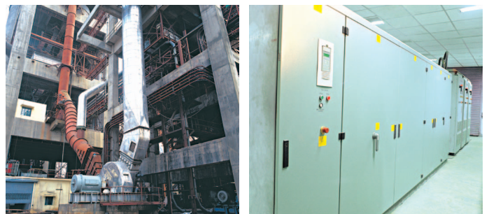
CCCL's cement plant in Karikkali with an annual capacity of 1.2 million tons; Cement mill fan installed at the CCCL site; ACS 1000 controlling the motor