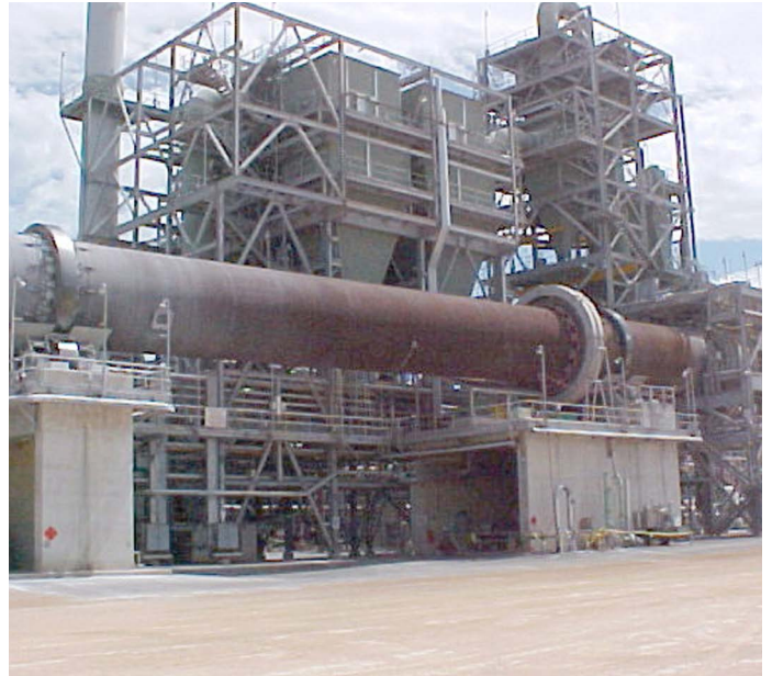
View of the 58 m long rotary kiln at Worsley.

An ACS 1000 drive system rated at 500 kW was selected to provide controlled torque and speed to the kiln.