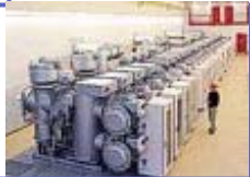
ABB Power Systems