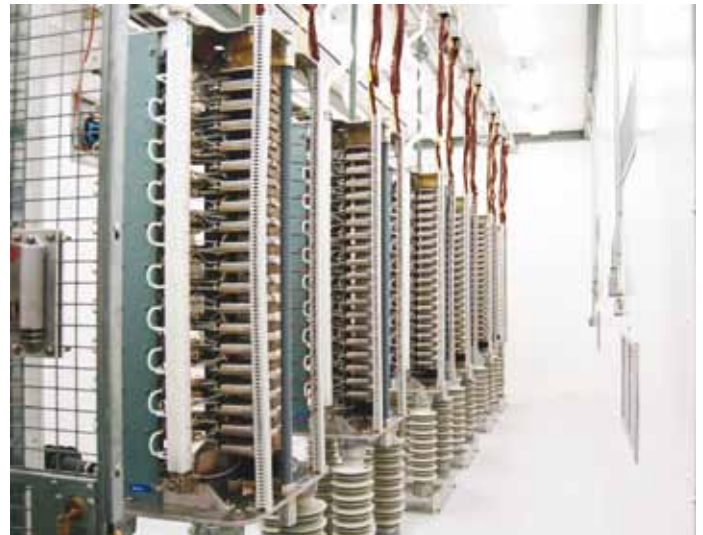
TCR valves for 69 kV directly connected SVCs

grading circuits, thyristor electronics, heat sinks and clamping arrangement. The valves are designed as free standing single assemblies and each valve comprises two series connected standard valve modules per phase (a total of six modules per valve), each with a stack of BCT (Bi-directionally Controlled Thyristors). In the BCT, anti-parallel thyristors have been integrated on a common silicon wafer and therefore, only one thyristor stack is required. With this arrangement, only half the number of thyristor housings and heat sinks is needed. The number of components in a valve and the number of connection points for the water cooling is reduced. This is obviously an improvement from a manufacturing, maintenance and reliability point of view.