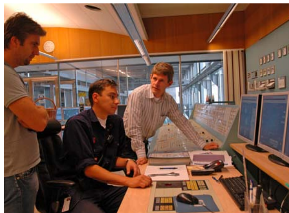
Control room in the Örebro cogeneration plant