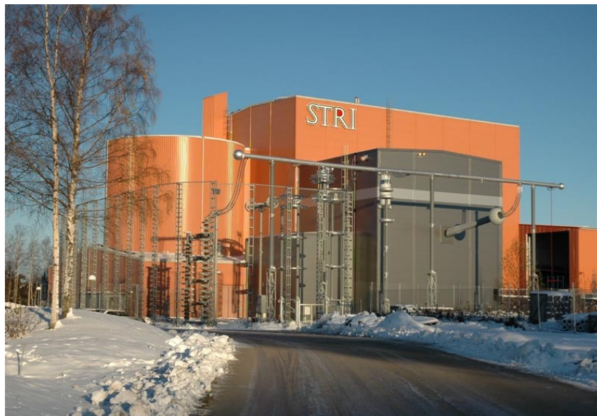
Fig. 1. 800 kV HVDC long term test circuit installation at STRI, Sweden.

In order to verify the long term behaviour of the 800 kV HVDC equipment, all relevant pieces of equipment were installed in a long term test circuit at STRI in Ludvika, Sweden (see Fig. 1), and energized at 855 kV DC, in November 2006.