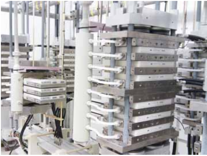
Fig. 3: Converter valve stacks

pole, the neutral, or the negative pole of the capacitor bank directly to any of the converter outputs. By use of PWM, an AC voltage of nearly sinusoidal shape is produced without any significant need for harmonic filtering. This contributes to the compactness of the design, as well as robustness from a harmonic interaction point of view.