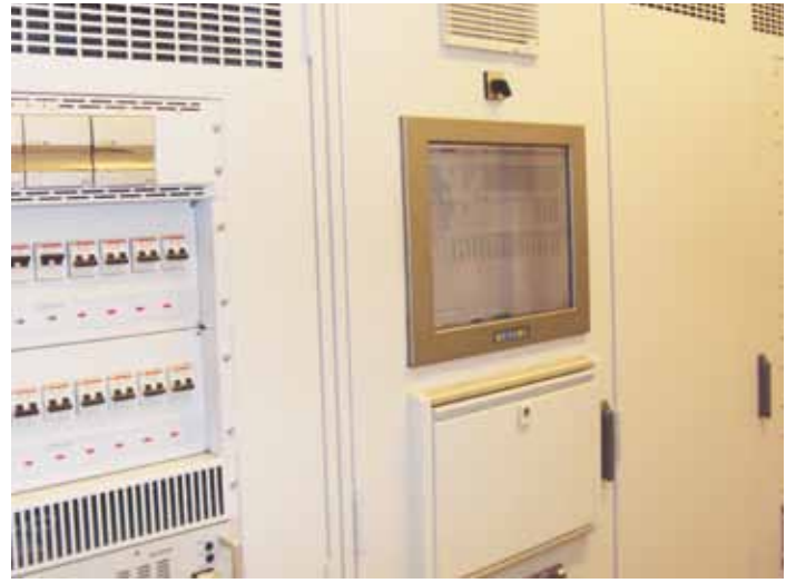
Fig. 5: Control system and DC voltage distribution