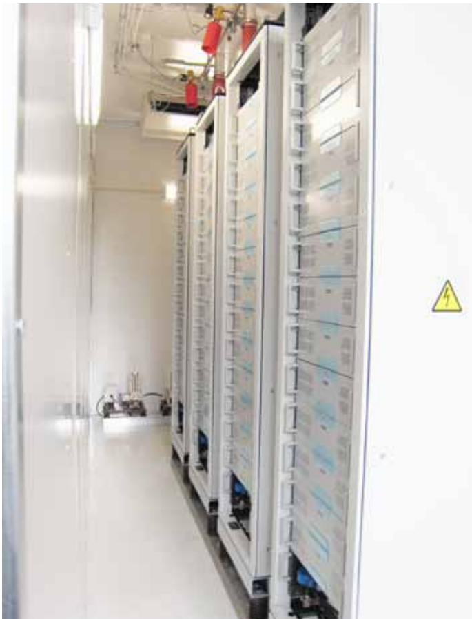
Fig. 4: Li-ion battery cubicles.

The battery system is composed of eight identical Li-ion battery stacks in series (Fig. 4). One stack comprises 13 battery modules, with 14 cells in each module. DC switches are included for isolating the battery system from the DC side capacitors at minor contingencies but still keeping the VSC in operation, thereby maintaining reactive power control.