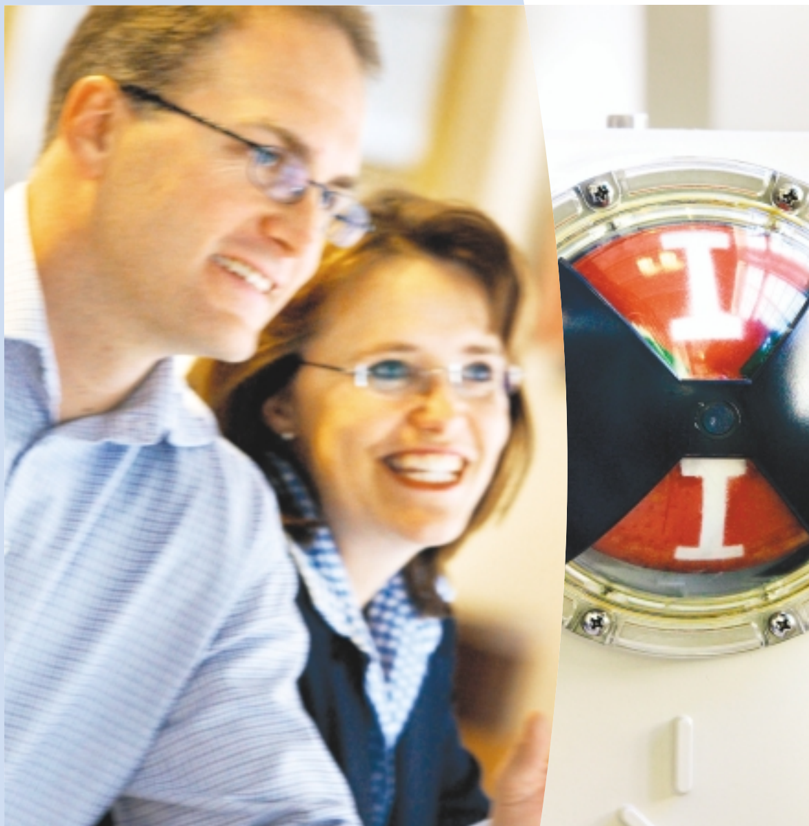
ABB Power Technologies, Power Systems Substations – World leader in power technology