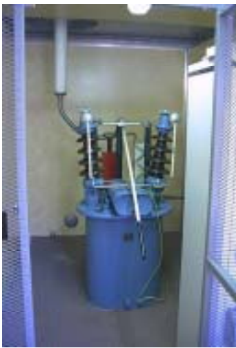
Figure 1. DC generator inside the container

The DC generator consists of an AC-regulator transformer, an AC transformer, a rectifier bridge and a filter circuit, as shown Fig. 1 (AC-regulator transformer is not in the figure). The DC generator has a rating of 600 mA as maximum current at 90 kV. The level of ripples at a continuous 200 mA current is 5.8%.