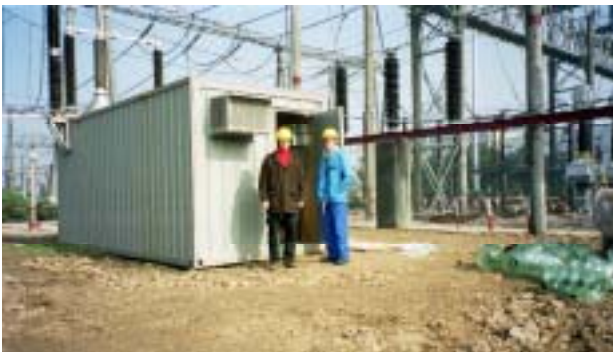
Figure 2. The container after installation at Huangdo

As shown in Fig.2 is the container after installation with a wall bushing, a disconnector and arresters on the top.