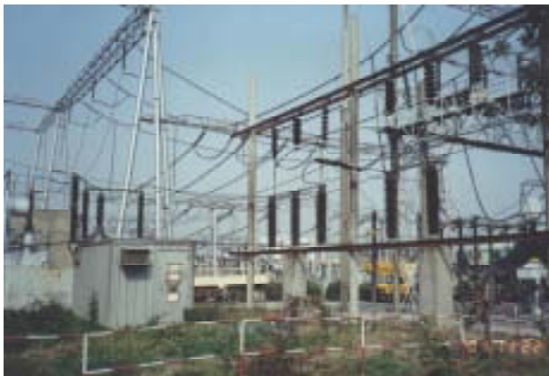
Figure 4. Overview of the test station at Huangdo

The Huangdo 500 kV substation is located 25 km north of Shanghai. The substation is surrounded by farmland with a highway toward Shanghai nearby. The pollution test station was installed in an open area between the 220 kV and 500 kV switchyards, about 150 m from the highway. Fig. 4 is the overview of the test station inside the Huangdo substation.