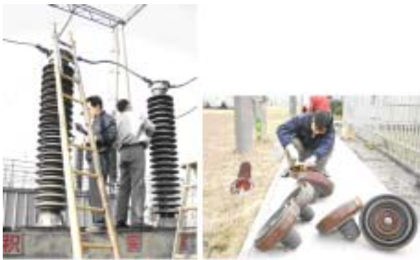
Figure 5. Pollution sampling at Guojiagang test station

The test period at this station was from October 15, 2002 to March 12, 2004. Since the main pollution accumulation period had already started at the time of commission of the test station, the test period was extended to March 2004. Operational experience from AC systems in this region has shown that the occurrence of pollution related flashovers is mostly in the period from February to March. The measurement that took place at the end of the test period is therefore considered to be representative for the yearly maximum pollution level.