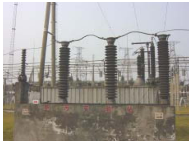
Figure 3. Line insulators (higher view) and station-post insulators (lower view) used in the test at Guojiagang

The weather station is a commercially available product. It measures the rain intensity, air temperature, relative humidity, wind speed, wind direction, and the solar radiation. It is driven by a solar panel.