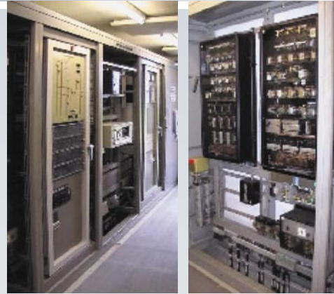
Control and protection panels before... ...and after the retrofit

All of EGL's objectives are achieved through close cooperation with a competent supplier