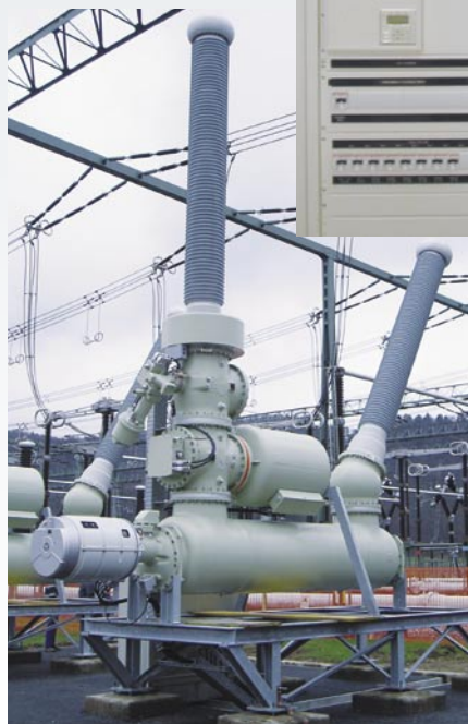
Compact hybrid switchgear solution

For more information please refer to the responsible ABB sales engineer for your country or to the address mentioned below.