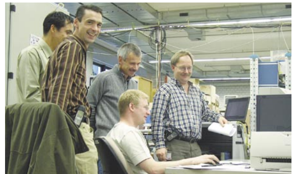
EGL's and ABB's teams during the successful factory acceptance test in Baden/Switzerland.