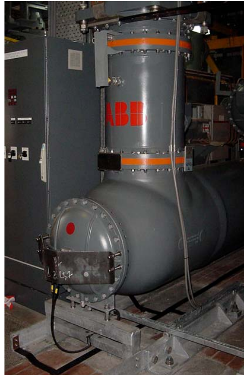
ABB Interface to existing back parts

Retrofit improves the availability and reliability of your installations in the most cost-effective way