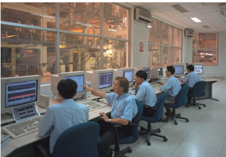
The drive control system can significantly impact overall energy efficiency

In order to optimise the energy efficiency of a paper machine drive it is important to look at the system as a whole. This is because efforts to boost the efficiency of a single component in isolation may end up causing increased losses elsewhere. The relationship between motor efficiency and VSD efficiency, for example, always involves a trade-off. Using a low switching frequency will deliver higher VSD efficiency, but will result in greater losses in the output filtering or motor. It is therefore crucial to understand how the type of power supply, VSD switching frequency and output voltage, and the motor design, affect total system efficiency. Achieving optimum energy efficiency involves much more than simply comparing the catalog values of alternative components.