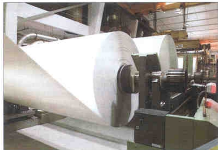
THE WIND-UP END OF BM1.

Jymet Engineering supplied the broke conveyors and Core Link delivered a broke roll slitter. The new