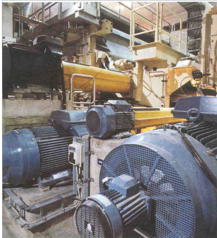
THE DRIVE SIDE OF BM1 SHOWING THE NEW ABB MOTORS.

lubrication system for the whole machine is a centralised system from Safematic.