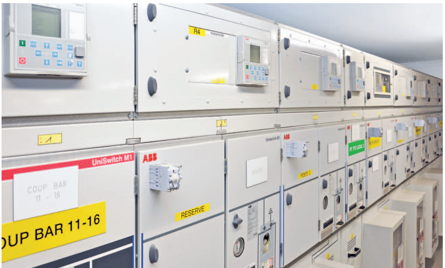
The 615 series IEDs were installed in ABB's Uniswitch switchgear.

The IEC 61850 standard offers a range of features and benefits for protection and control applications, among them peer-to-peer communication using GOOSE. Apart from enabling fast and supervised communication, the use of