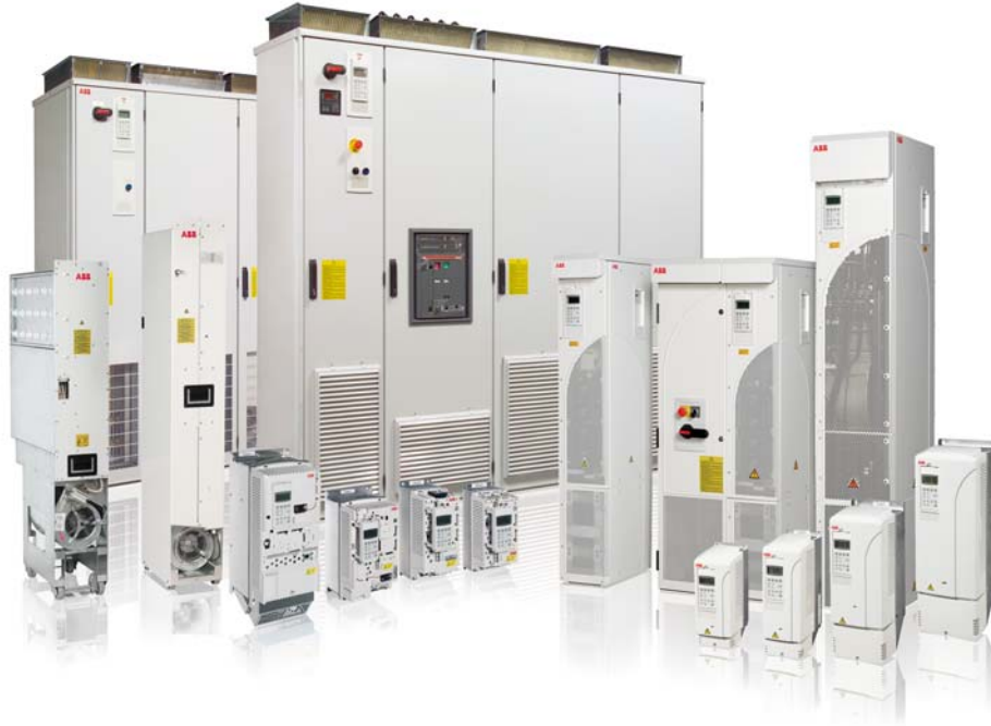
ABB recommends its preventive maintenance and reconditioning services to help control and cut operating costs associated with its drives. On-site preventive maintenance is designed around drive maintenance schedules and significantly reduces the risk of failure while increasing the lifetime of a drive. Reconditioning in an authorized ABB drive service workshop should be considered when major components need replacing according to the maintenance schedule. Both services contribute to higher reliability of the installed plant which in turn helps maintain high productivity.