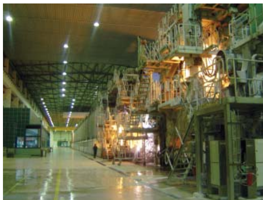
RAK PM1 hall

ABB has a maintenance schedule for every drive product family. They are based on ABB's extensive experience and know-how of manufacturing and maintaining electric drives.