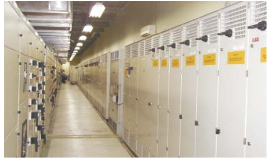
ACV700 drive cabinets