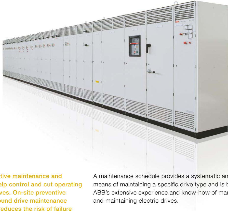
ABB recommends its preventive maintenance and reconditioning services to help control and cut operating costs associated with its drives. On-site preventive maintenance is designed around drive maintenance schedules and significantly reduces the risk of failure while increasing the lifetime of a drive. Reconditioning in an authorized ABB drive service workshop should be considered when major components need replacing according to the maintenance schedule. Both services contribute to higher reliability of the installed plant which in turn helps maintain high productivity.