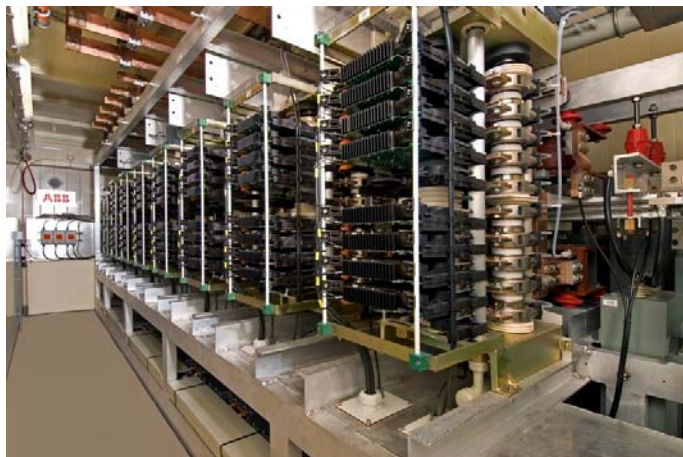
Figure 1: Power electronic part

The PCS 6000 Rail is a MV static frequency converter allowing to connect 3 phase public grids to single phase railway power grids running at 16.7 or 25 Hz. The sophisticated design based on the broad experience in the field provides a wide range of benefits. For example the bi-directional power transfer allows feeding power back to the public grid while trains descend from mountains generating power.