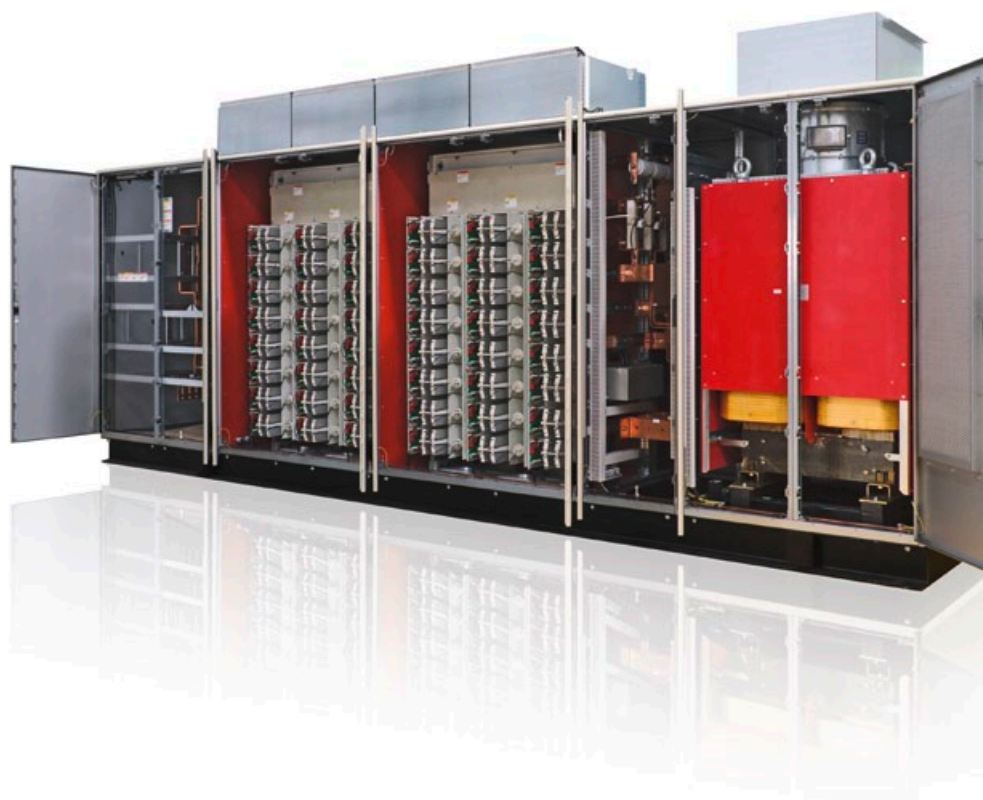
MEGADRIVE-LCI static frequency converter in MEGATROL Power configuration

For applications other than MEGATROL, MEGADRIVE-LCI converters are available up to 72 MW or higher on request.