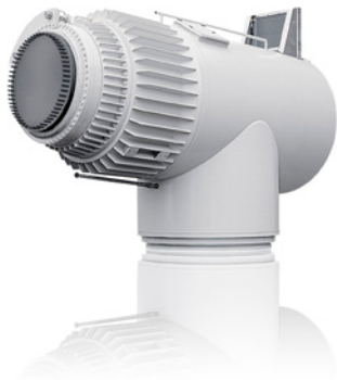
1 MW fully integrated MS PMG.