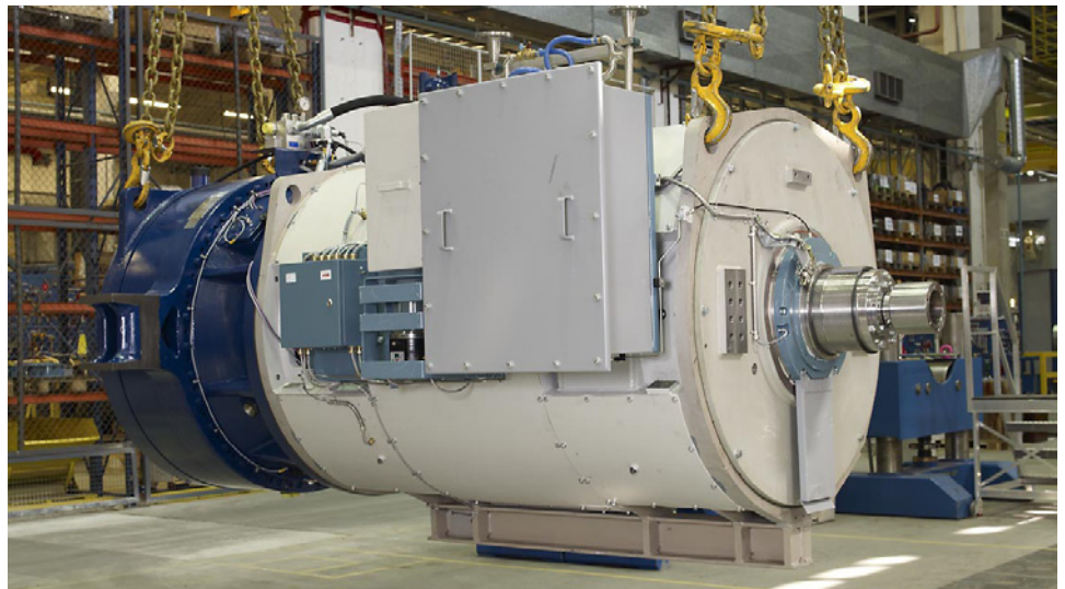
New semi-integrated MS PMG prototype with gear.