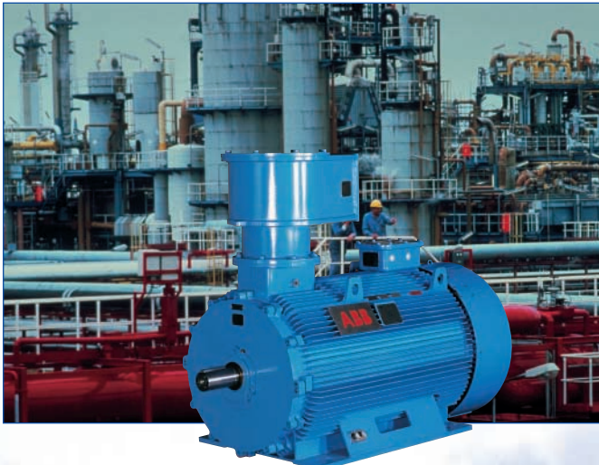
AMD POWER RANGE classified as: AEX d II B T4

AMD flameproof machines are also certified according to EN Standards, including ATEX Directive 94/9/EC. They are manufactured in compliance with: