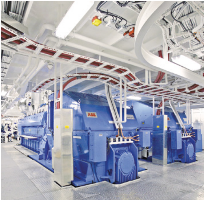
ABB synchronous machines are mainly used as propulsion motors, and as main, auxiliary and shaft generators, in a range of vessel types.