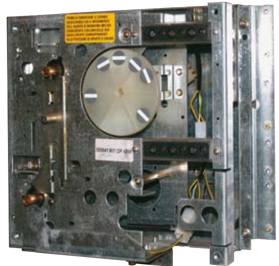
HD4 circuit-breaker with side operating mechanism.

Otherwise, the gas-free circuit-breaker is to be professionally disposed of in accordance with the relevant laws. The substances accruing in that process are — in as far as possible — to be recycled. Disposal is to be documented in accordance with the relevant statutory provisions and directives.