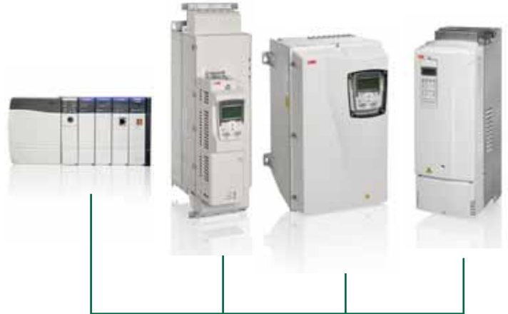
ABB Low Voltage Drives library of User Defined Data Types (UDT) and the Add-On Instruction (AOI) reduces development time when configuring and commissioning ABB Low Voltage Drives on a ControlNet or EtherNet/IP network.

Universal Connectivity – Simplifying ABB drive commissioning and connectivity to ControlNet™ and EtherNet/IP™ networks