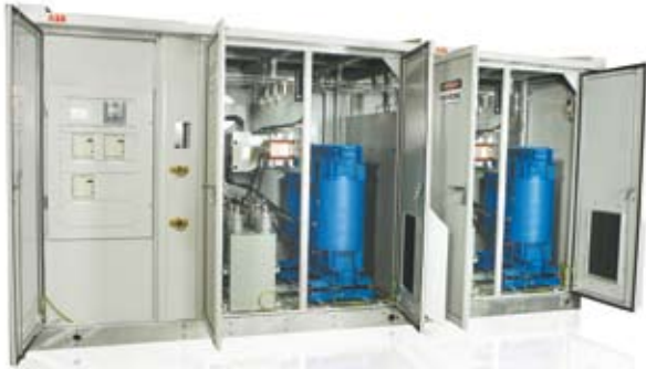
IP44 ALUMINIUM INDOOR/OUTDOOR ENCLOSURE