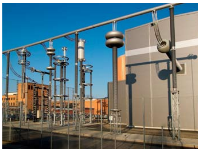
800 kV HVDC long term test circuit installation at STRI.

With the confidence gained with satisfactory operation of the long term test circuit, the conclusion is that 800 kV DC will account for a significant part of world growth in power transmission capacity over the next several years.