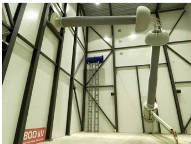
The wall bushing (left) and the transformer bushing (right) inside the “valve hall”.