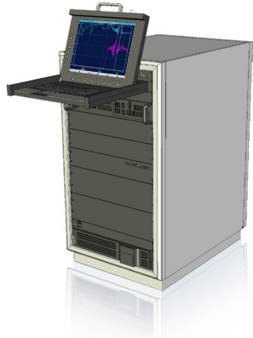
The secure ABB ServicePort improves service delivery and reduces costs

You want high-value ABB services and access to leading ABB expertise to help you maximize system and optimize process performance, and you want these services delivered quickly and more cost-effectively than conventional travel allows.