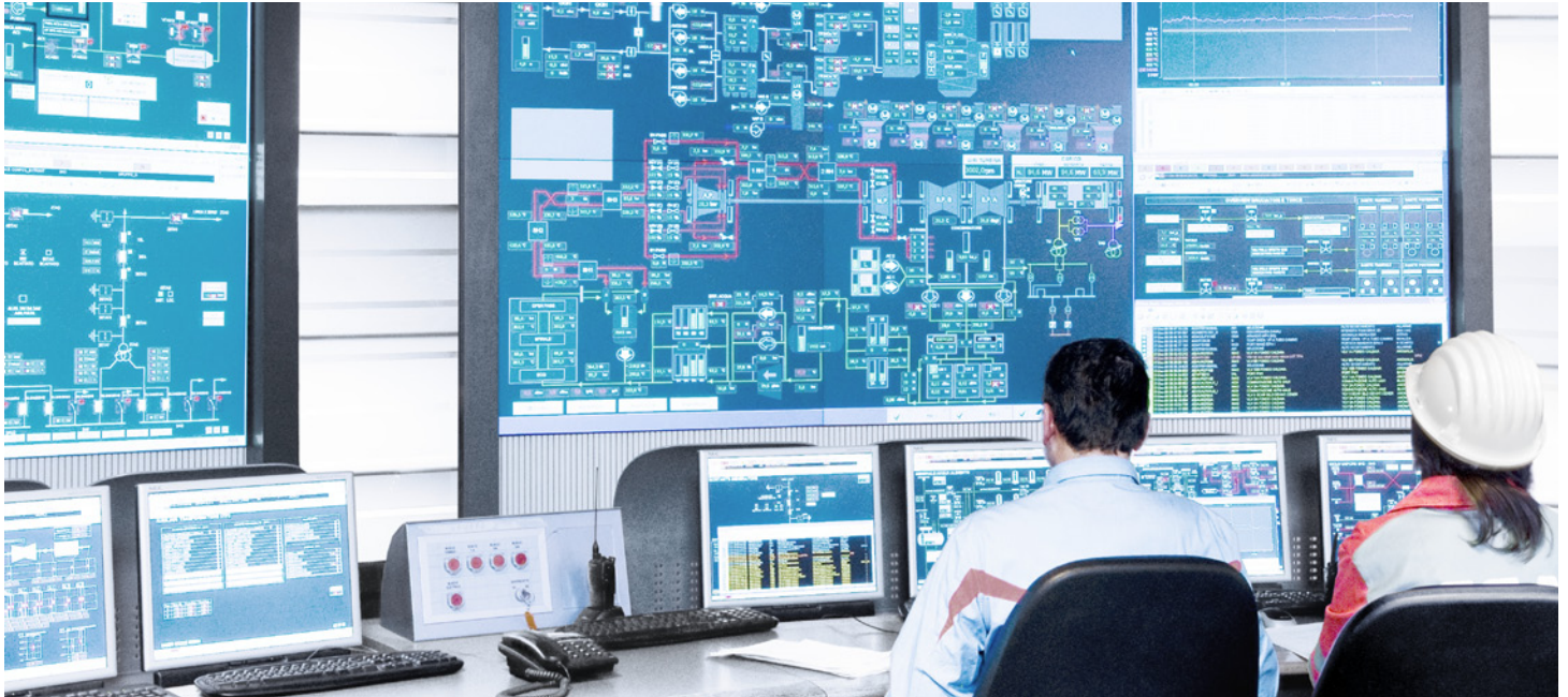
ABB upgrade improves quality at aluminum plant in Germany Process expertise key to successful upgrade

An aluminum plant in Germany faced a dilemma: company managers wanted to improve product quality by adding a new stretch leveller. But since the stretching process is complex and all of the equipment involved must operate together smoothly, the company had to find a supplier that could integrate the new automation expertly with the rest of the line.