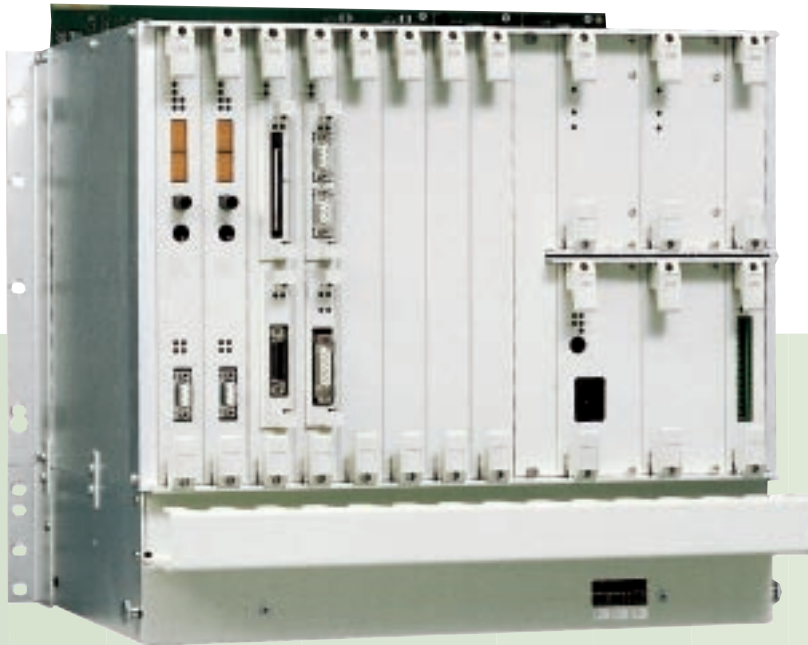
An Advant Controller 450 central rack with central unit redundancy offering bumpless change-over in case of trouble.

Both central and distributed I/O are available. Central I/O (S100 I/O) modules are plugged into I/O racks installed in close proximity to the CPU rack/cabinet.