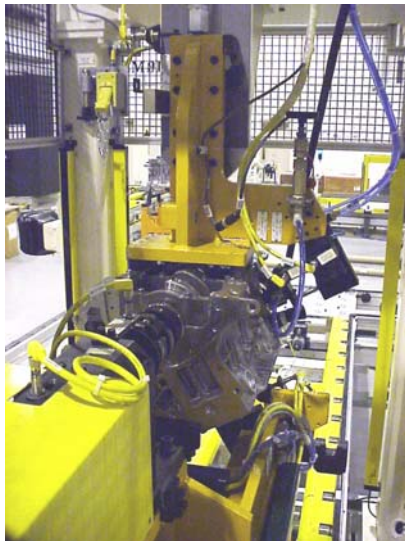
Plot 08 Missing Connecting Rod 2 Bottom Bearing