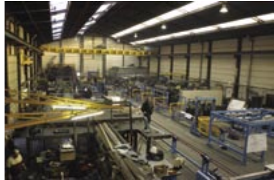
Assembly hall at De Simone.