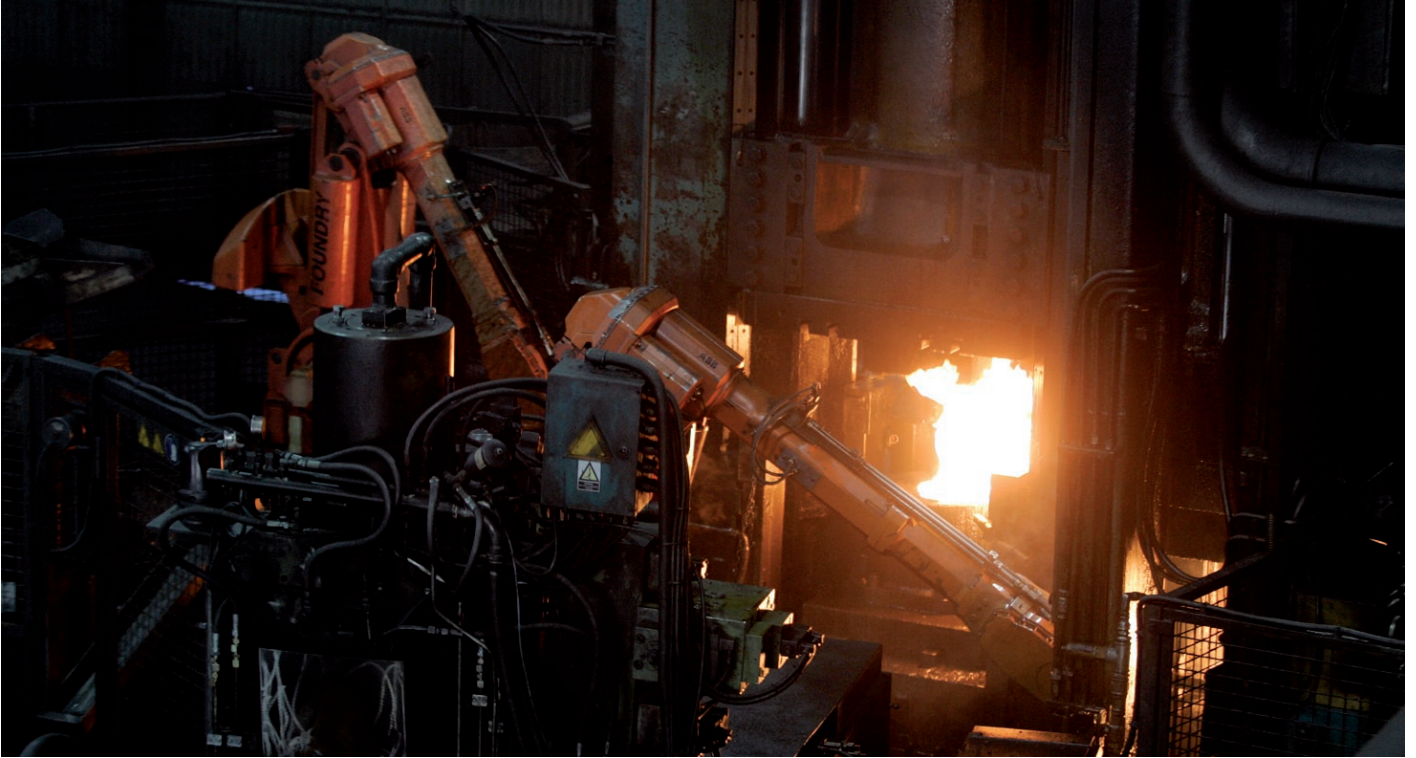
ABB Service Agreement with Remote Service Case Study: Comercial de la Forja (Comforsa)

Companies supplying parts to the automotive sector have to be more efficient than ever. Comforsa, a Spanish company, has experienced that ABB robots combined with Remote Service is helping to improve production processes.