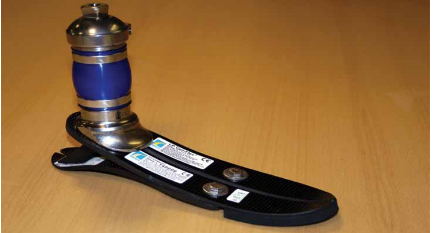
The Flex-Foot will be used by the world's fastest amputee Marlon Shirley in the Olympic Games, Athens 2004.

Össur product line represents the best in modern prosthetics and orthotics. The carbon fiber Flex-Foot is synonymous with high performance. Familiar to millions through the achievements of Paralympic athletes, the special properties of the Flex-Foot are equally outstanding for daily use and different activity levels.