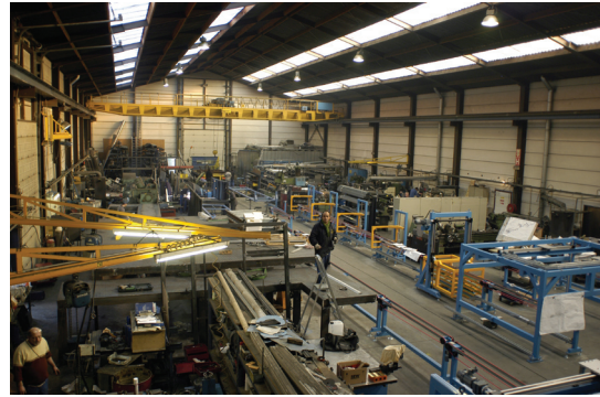
Assembly hall at De Simone.