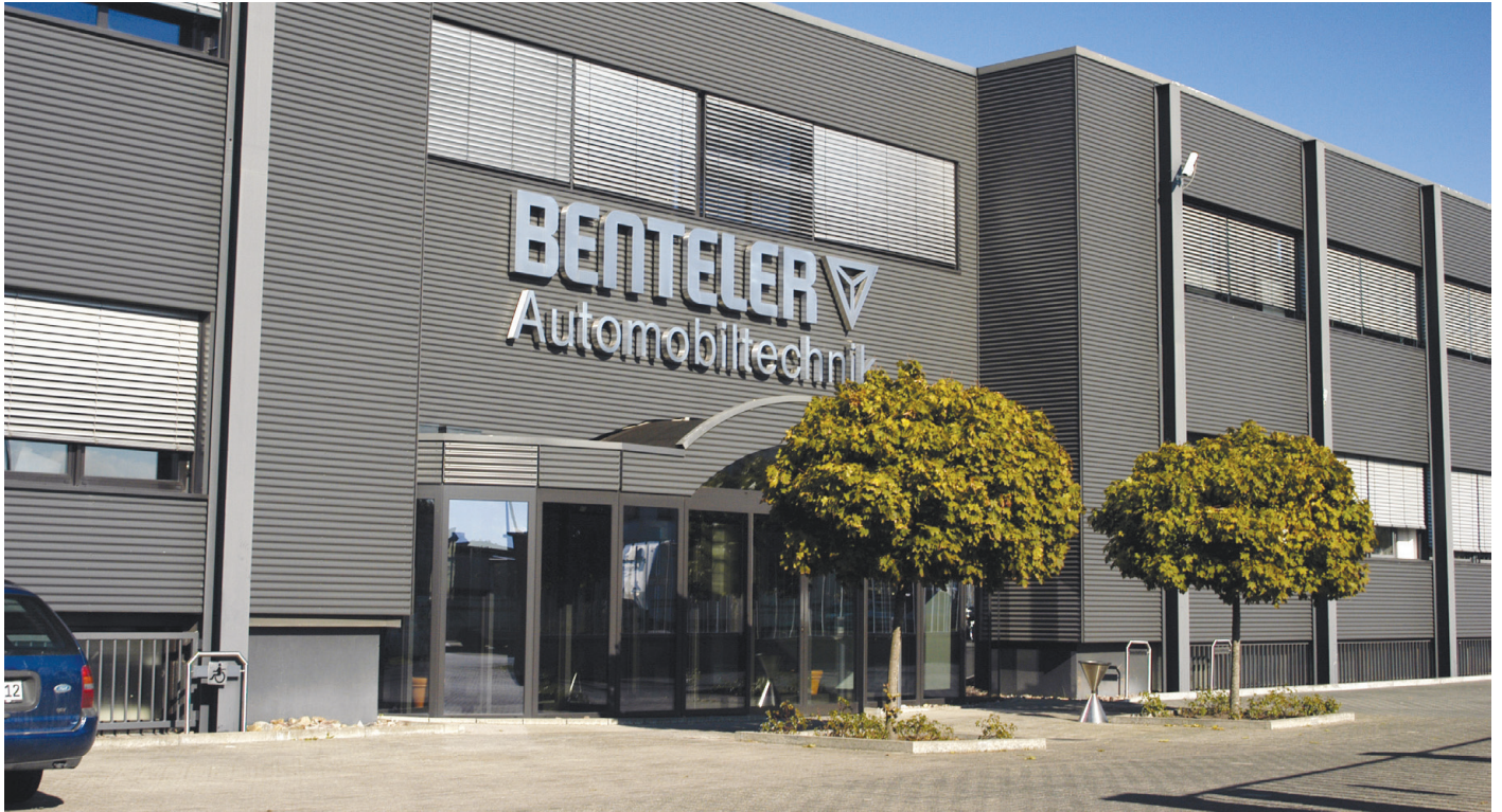
Benteler Plant in Paderborn supplies automotive parts to all major car manufactures world wide.

Benteler Paderborn was the first Benteler automotive plant. Today is the plant one of the biggest Benteler plants worldwide with 1500 employees. Their business is not only one of the largest automotive suppliers but also one of the most important steel tube manufactures in Europe.