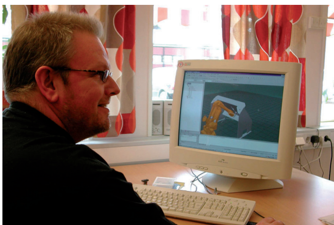
Offline programming in RobotStudio.

The car industry, our suppliers, has very high quality requirements. RobotStudio has helped us to be able to meet these requirements using offline programs. Without RobotStudio, we would not have completed certain projects. In the latest project in which we used RobotStudio, it would not have been possible to program online. It is quite complex programming for milling a certain component.