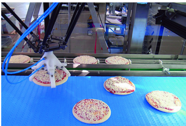
Picking pizzas from a moving conveyor belt. One wrong move and all the accoutrements are spilt onto the factory floor.

The partnership with ABB and the FlexPicker product has enabled Vortex to compete with much larger German and Swiss competitors. This has contributed to Vortex's growth and given the company a better presence internationally.