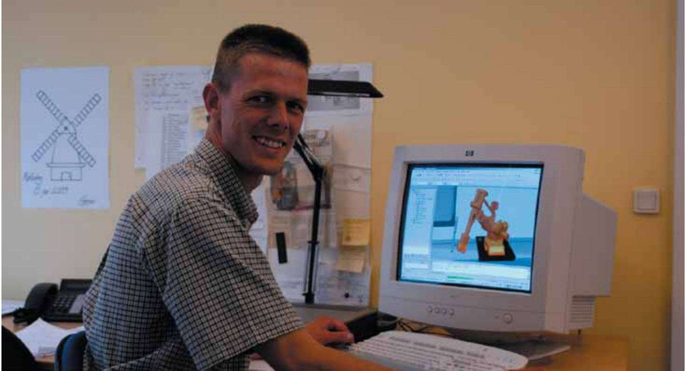
Robot programming at your desk.

ProInvent A/S, a Danish system integrator that specializes in factory automation is well known for its innovative engineers and high tech approach. ABB turned to ProInvent and asked them to do an installation at their customer Alpharma HPI, a pharmaceutical manufacturer.