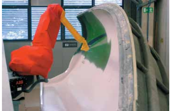
There was no other alternative to program the robot than offline.

"We have looked at other software for offline programming but they were a bit too large and complex for our area of application. RobotStudio's functions were completely adequate. By using ABB's robots, it is very simple to move the programs between robots and RobotStudio," explains Kent.