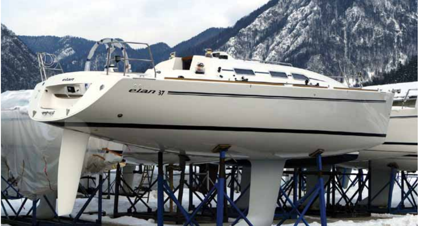
Elan produces sailing boats from 31 feet to 45 feet long. These are quality performance cruisers with high safety.

Elan has been producing boats since 1949. In 1962 Elan started to produce boats from reinforced polyester. At present they make approximately 350 sailing- and power boats annually.