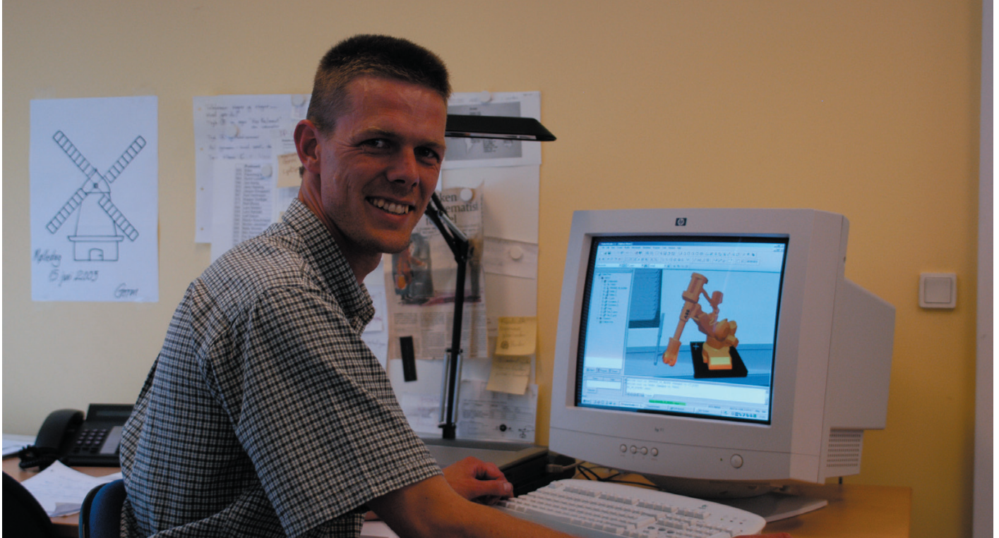
Robot programming at your desk.

ProInvent A/S, a Danish system integrator that specializes in factory automation is well known for its innovative engineers and high tech approach. ABB turned to ProInvent and asked them to do an installation at their customer Alpharma HPI, a pharmaceutical manufacturer.